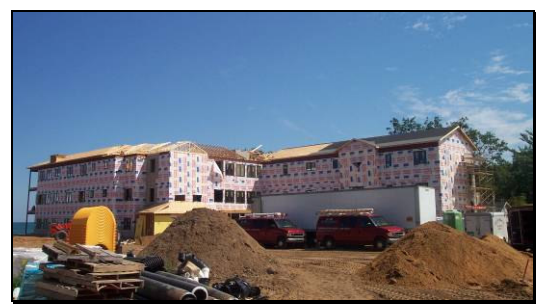
Building under construction